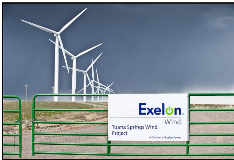
Exelon Wind - Tuana Springs Wind Project Hagerman Idaho