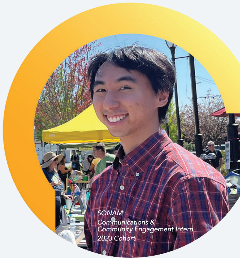
SONAM Communications & Community Engagement Intern 2023 Cohort