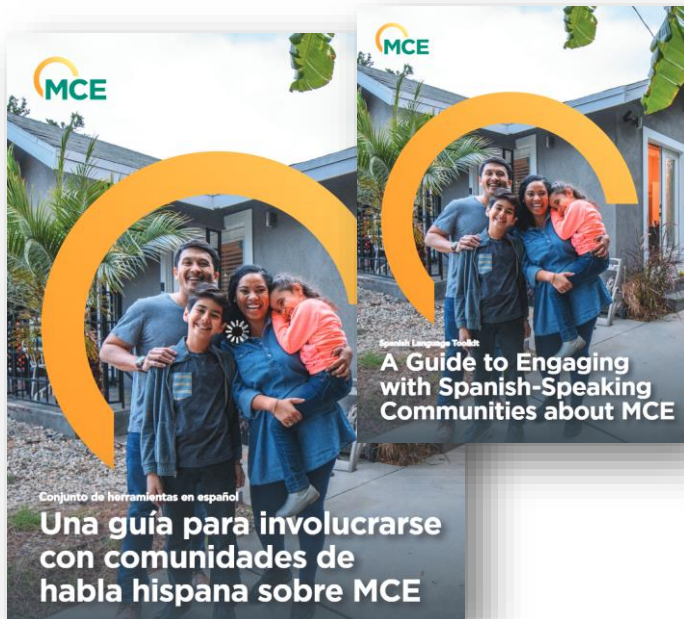
Spanish Language Toolkit