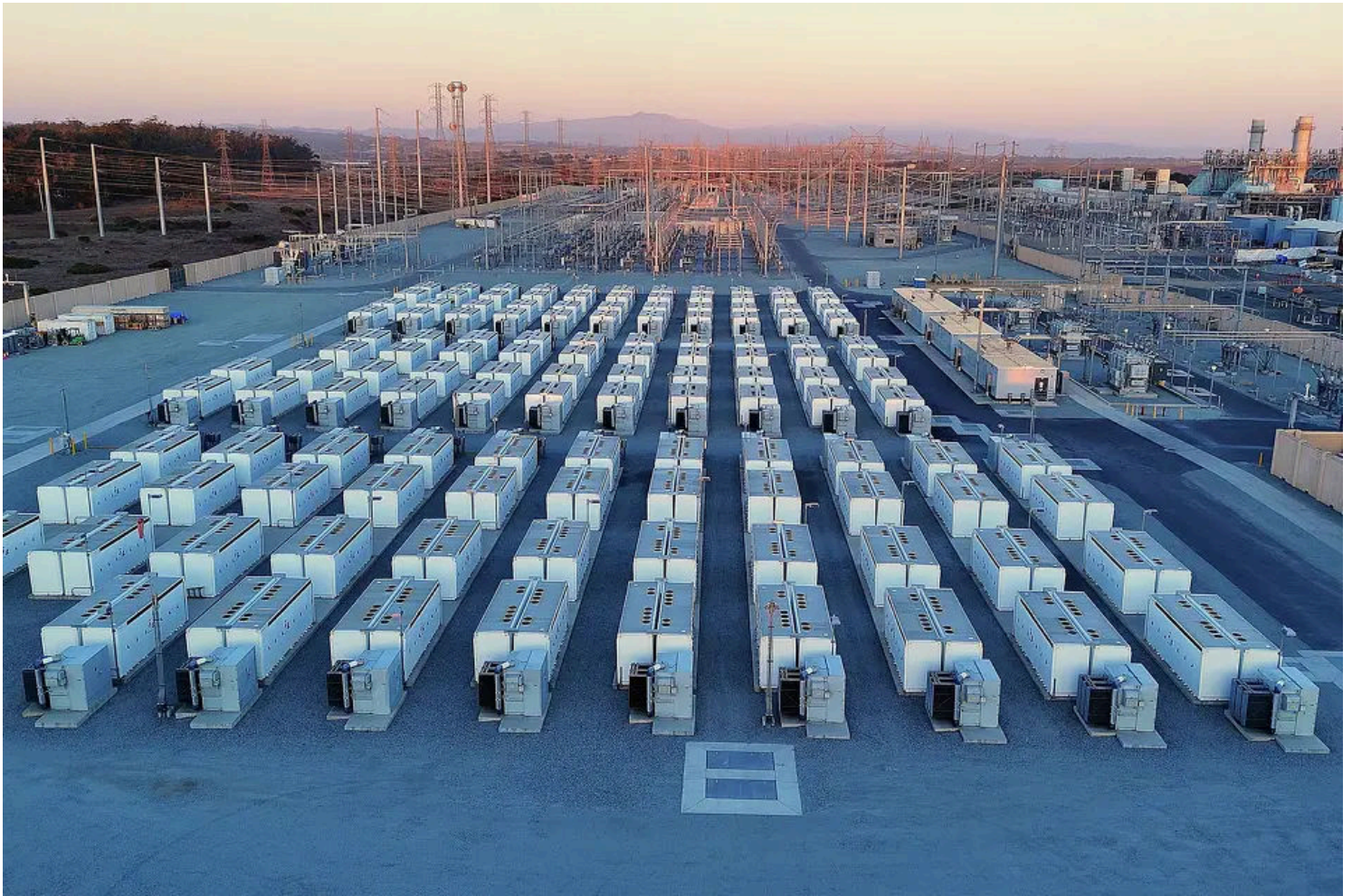
FILE: Battery storage rows at Moss Landing Power Plant.

Cole said the private property where Corby is slated to be built used to be an almond orchard — a symbol, she said, of Solano County as a rural agricultural hub. If approved, the sprawling energy storage plant would be literally across the street from her doorstep.