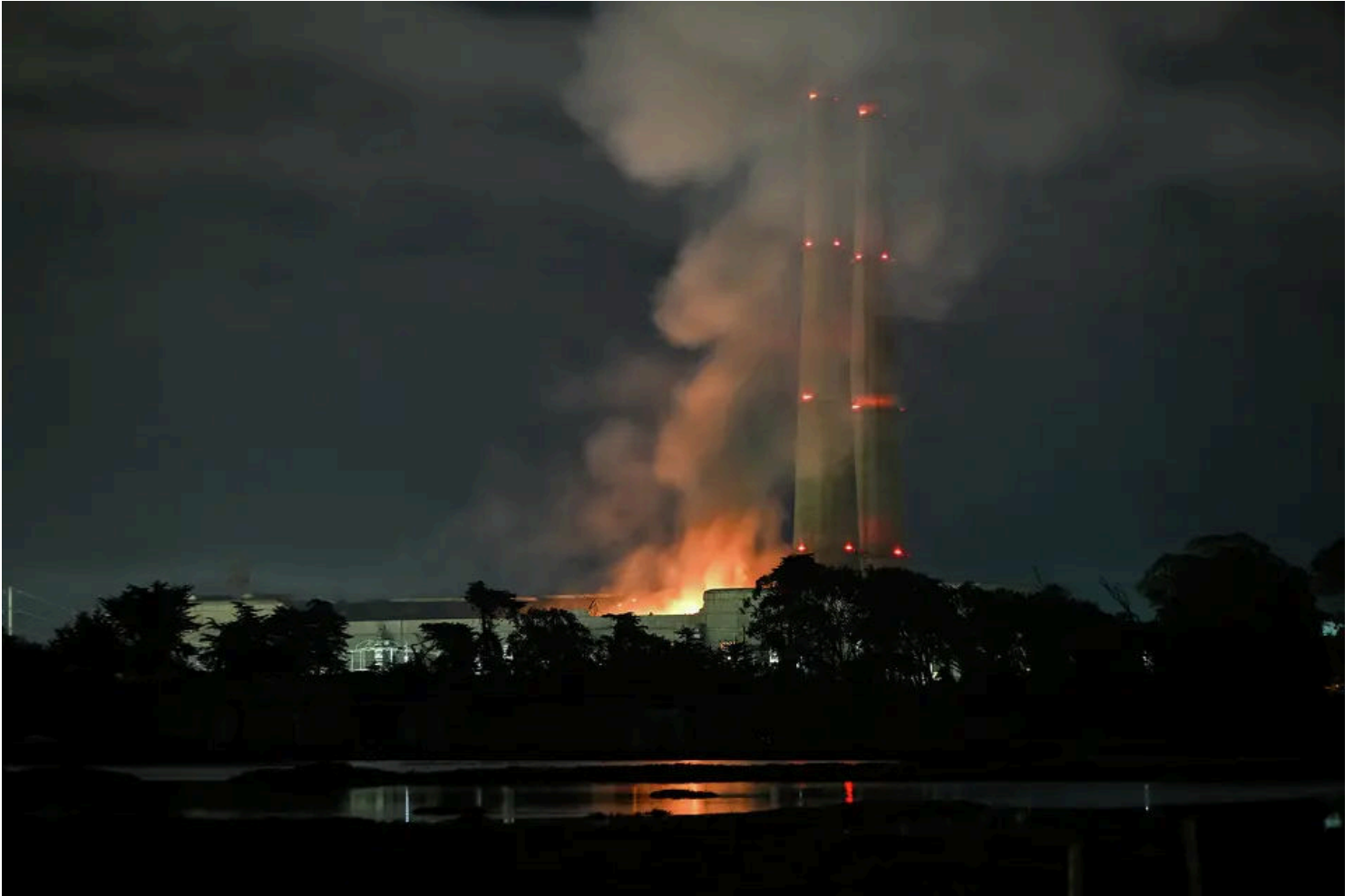
A fire burns at Moss Landing Power Plant on Jan. 17, 2025, on Pacific Coast Highway in Monterey Bay, Calif.